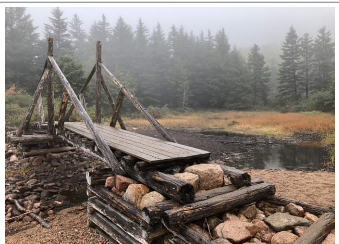
Create your own definition of form and function by using common materials in uncommon applications.

First, completely drain the rain barrel to avoid freezing or cracking. Then remove the spigots, screen, and hose and store them in a place where you can find them easily in the spring. You may also want to rinse out the rain barrel in order to remove any sediment. If you are storing the rain barrel outside, turn it upside down to keep out the rain, ice and snow. If possible, weight it down or secure it to keep it from blowing away. After you've prepped the rain barrel for winter storage, consider redirecting the downspout so that melting snow and ice flows away from the foundation of your home. Attach another piece of down-spout if necessary.